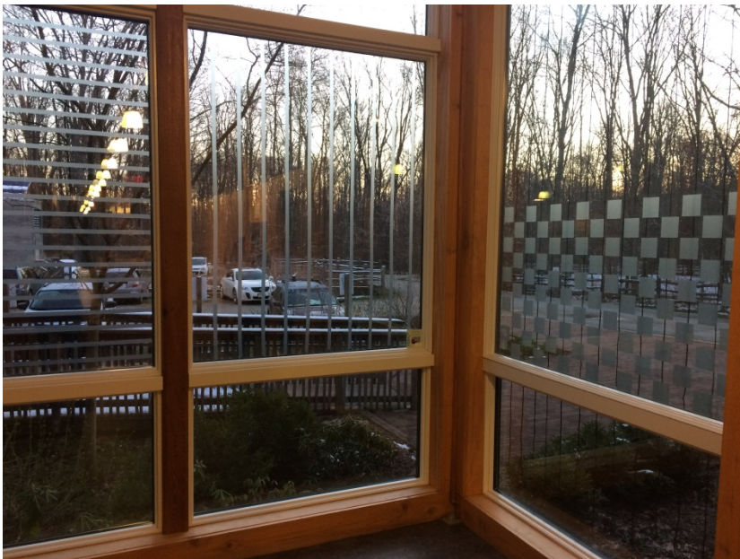
(ABC Tape, Acopian Bird Savers)

Placed on the OUTSIDE surface of windows: