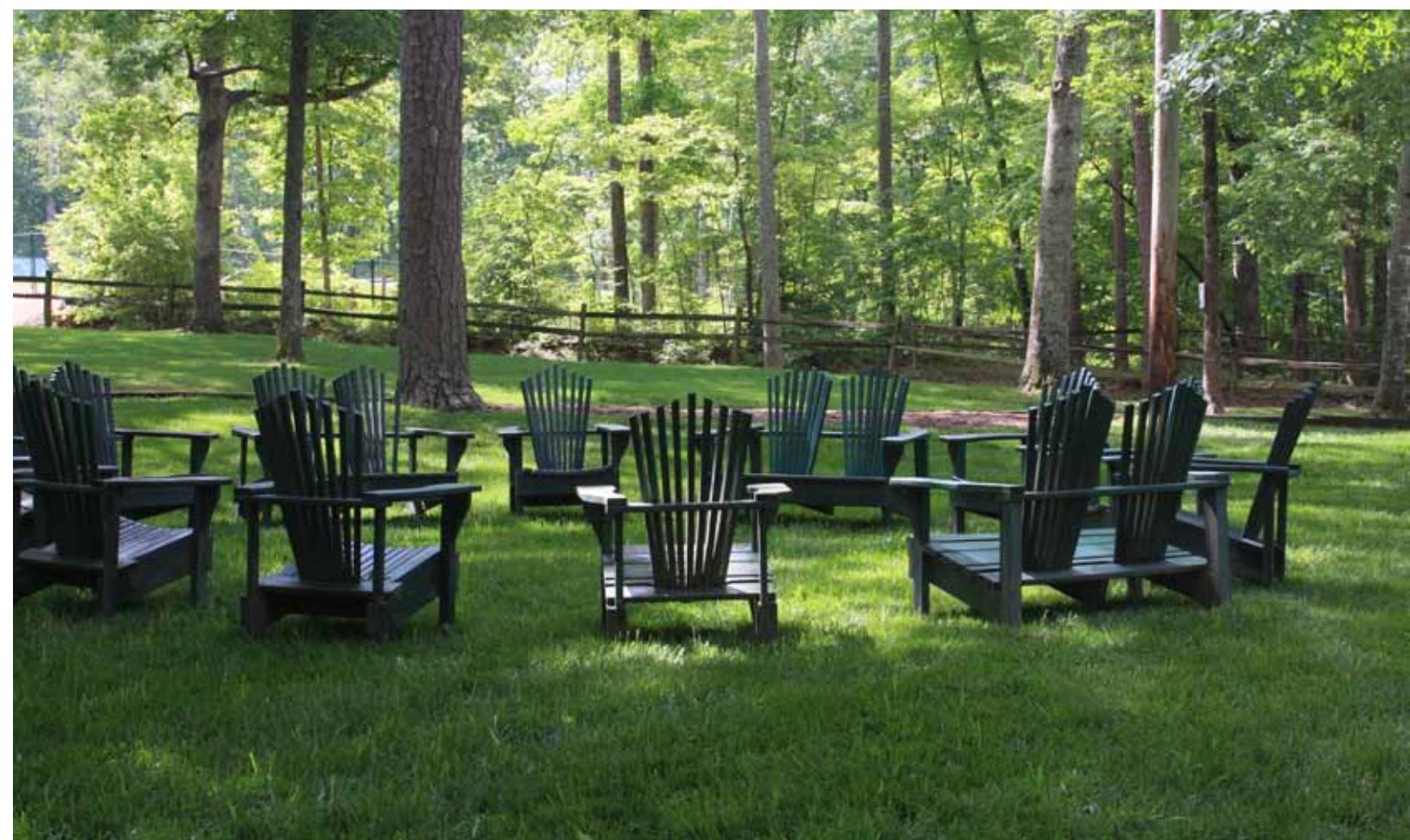
Birmingham Audubon Mountain Workshop celebrates its fortieth anniversary this May, 2017. Photo of past Birmingham Audubon Mountain Workshop courtesy Michelle Blackwood